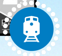
Multimodal Transportation Center